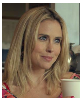
ANNA HUTCHISON (“Angie Miller”)