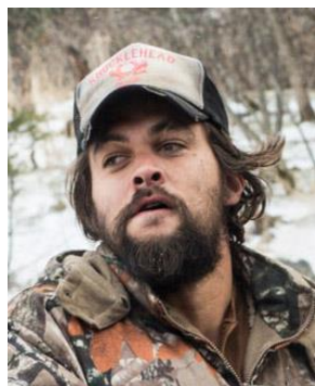
JASON MOMOA (“Joe Bright”)