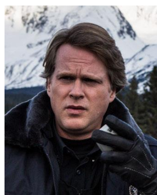
CARY ELWES (“Jim Huxley”)