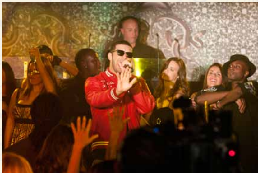
still from BREAKAWAY

At only the beginning of his musical career, DRAKE has already worked with hip-hop moguls Lil' Wayne, Birdman, Kanye West, Eminem, and Jay-Z. With the success of his mixtape So Far Gone , DRAKE has earned and been nominated for several awards, including the Grammy Awards. He performed at the 2010/2011 Grammy Award show. DRAKE has won 2 Juno awards and has been nominated for 7 MMVA's.