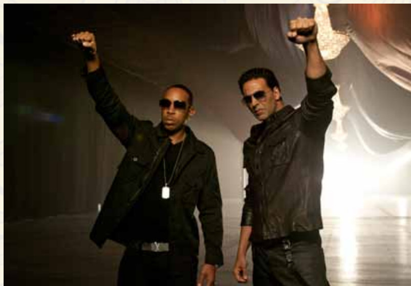
still from BREAKAWAY

Although he's best known for his infectious tunes, LUDACRIS has shown that he's equally adept at writing powerful songs with serious subject matter, for example on Runaway Love . This versatility and artistic complexity enabled Ludacris to make a seamless transition to acting. His acclaimed performances in film ( Crash , Hustle & Flow ) and television ( Law & Order: Special Victims Unit ) have Hollywood and critics alike buzzing about his increasingly impressive screen resume. The recently launched Conjure cognac joins LUDACRIS' Disturbing Tha Peace Records as yet another successful venture of the business mogul.