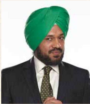
Gurpreet “Ghuggi” Singh as “ Uncle Sammy ”

Gurpreet “Ghuggi” Singh is one of the most popular actor/comedians from the North of India. Having acted in some of the most successful films and television programs in India, Ghuggi is a household name with South Asian audiences globally. Ghuggi has been part of international box office hits such as Mera Pind , Race , Singh Is Kinng and the recent smash hit film Munde U.K. De . Ghuggi also won the “Has Balige” competition for his performance as a comedian.