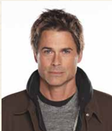
Rob Lowe as “Coach Dan Winters”

One of Rob Lowe ’s earliest roles came in the 1983 TV movie Thursday’s Child , for which he received his first Golden Globe nomination for “Best Actor in a TV Movie/Miniseries”. Lowe made his film debut in Schoolboy Father , followed by Class . His breakthrough came in 1983, when he and Estevez were cast in The Outsiders , which remains one of his most famous roles. Lowe played the role of Sodapop, the brother of the main character Ponyboy (C. Thomas Howell) in the movie. Lowe and Estevez reunited in St. Elmo’s Fire , making them the two more popular boys of the Brat Pack. He followed it up with About Last Night and the 1986 cult sports drama Youngblood . He also received a second Golden Globe nomination for “Best Supporting Actor” for his role as the mentally disabled Rory in Square Dance (1987)