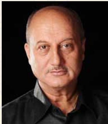
Anupam Kher as “ Darvesh Singh ”

Anupam Kher , regarded as one of the finest actors of Indian cinema with over 400 Indian and international films to his credit. He is also one of the few Indian actors to achieve international recognition, with the smash hit film Bend It Like Beckham . In 2004, the Government of India honored him with the prestigious Padma Shri award for his contribution to Indian cinema. Kher has been the recipient of many prestigious international film awards and honours throughout his tremendous career.