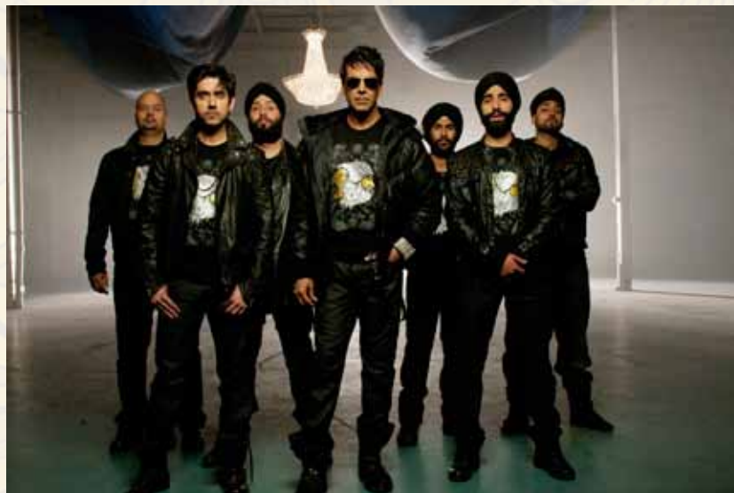
still from BREAKAWAY

Kumar began his voyage in the field of entertainment in 1993 and has completed over 130 films. Often being compared to India's version of Brad Pitt, his rugged good looks and dare devil persona have allowed him to introduce martial arts into this cinema becoming Bollywood's first true action hero. After starring in continual box office smashes, Kumar is hailed as King Kumar in Bollywood and is one of the most sought after actors of his time. His countless cinematic awards are symbols of his contributions to global cinema.