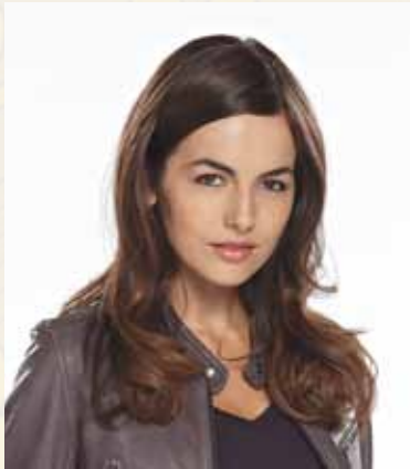
Camilla Belle as “ Melissa Winters ”

At age 24, Camilla Belle is an internationally acclaimed actress. In 2005, Belle starred in three independent feature films. She garnered acclaim for her work opposite Daniel Day-Lewis in The Ballad of Jack and Rose , directed by Rebecca Miller. She joined the ensemble cast of The Chumscrubber , also including Ralph Fiennes, Glenn Close, Jamie Bell, Allison Janney and Carrie-Anne Moss. She then starred with Elisha Cuthbert and Edie Falco in The Quiet , which premiered at the 2005 Toronto International Film Festival.