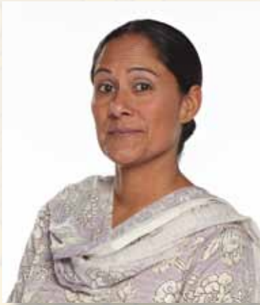
Sakina Jaffrey as “Livleen Singh”